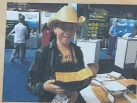
3D Printed Pancakes!